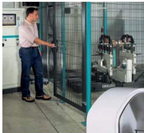
Class B protection

Series HM balancing machines usually require Class B or Class C enclosures. Safety class B should be chosen, if contact with the rotor or parts of the drive system may result in injury. Class C is to be used in cases, where the hazard of fragments detaching from the rotor cannot be ruled out entirely. The size, shape, hardness and tangential speed of a projected fragment are