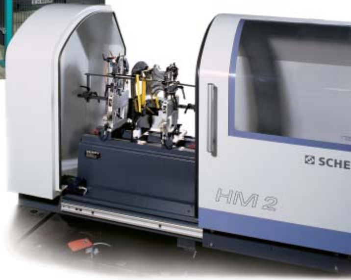
Class C protection

used to calculate the penetration potential. The safety enclosure must be capable of containing any such projected rotor fragments.