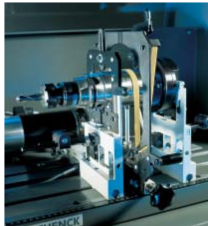
Overslung belt drive (BK)