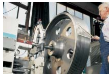
Universal-joint drive (U)

Selection of a drive system is determined by the shape or your rotors. Combinations of different drive systems on one machine are possible.