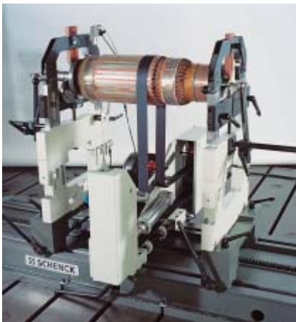
Underslung belt drive (BU)

Selection of a drive system is determined by the shape or your rotors. Combinations of different drive systems on one machine are possible. Underslung belt drives (BU)