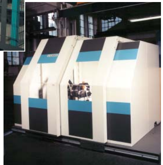
Class C protection

used to calculate the penetration potential. The safety enclosure must be capable of containing any such projected rotor fragments.