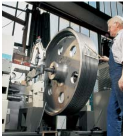
Universal-joint drive (U)

Selection of a drive system is determined by the shape or your rotors. Combinations of different drive systems on one machine are possible. Underslung belt drives (BU)