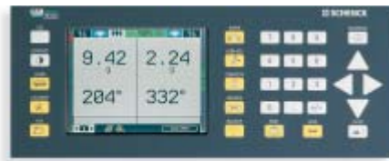
Measuring unit CAB 700

Schenck RoTec has the right micro-processor-based measuring instrumentation for you, whatever your balancing task. All measuring units offer a consistent operating philosophy, highest accuracy for processing of measured data, and a clear and easy-to-read display. They process measurement signals and provide for direct display of amount and angular position of unbalance. Permanent calibration means that only very few geometrical data