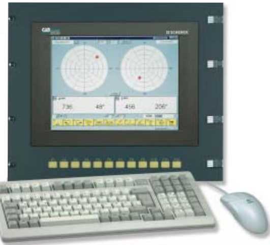
Measuring unit CAB 803

The CAB 803 offers extended functionality and superior ergonomics. A variety of application specific software modules are available for both measuring units.