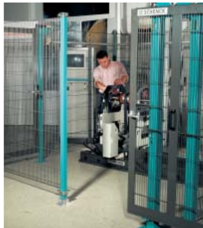
Class B protection

Series HM balancing machines usually require Class B or Class C enclosures. Safety class B should be chosen, if contact with the rotor or parts of the drive system may result in injury. Class C is to be used in cases, where the hazard of fragments detaching from the rotor cannot be ruled out entirely. The size, shape, hardness and tangential speed of a projected fragment are