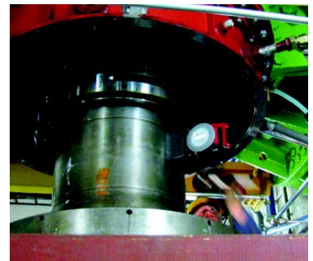
Fig. 6: Plumbness measurement on a vertical shaft with the INCLINEO®

The measurements were taken in two directions as well as at the 45° positions to ensure repeatability. These measurements were repeated at every