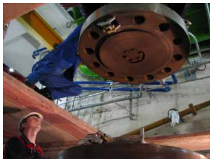
Fig. 2: ROTALIGN® Ultra laser transmitter attached with a magnetic bracket