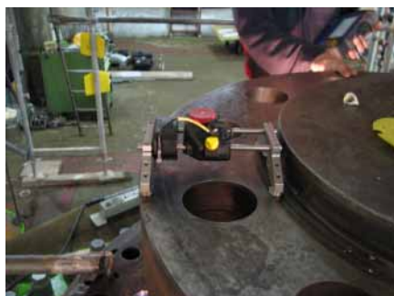
Fig. 3: Sensor attached with a magnetic bracket – equipped for wireless data transmission