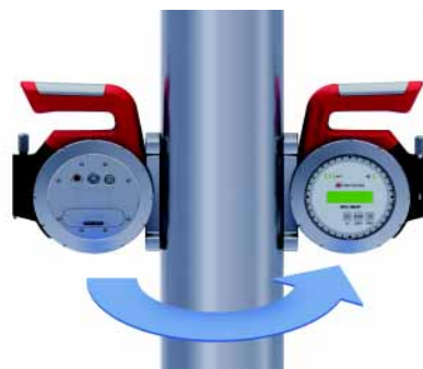
Fig. 5: Principle of plumbness measurement with INCLINEO®

The relative alignment of the shafts to each other is not the only criterion for large vertical machines. The plumbness of the shafts – i.e., the relationship between the rotating centerline to gravity – is also important. The tolerance