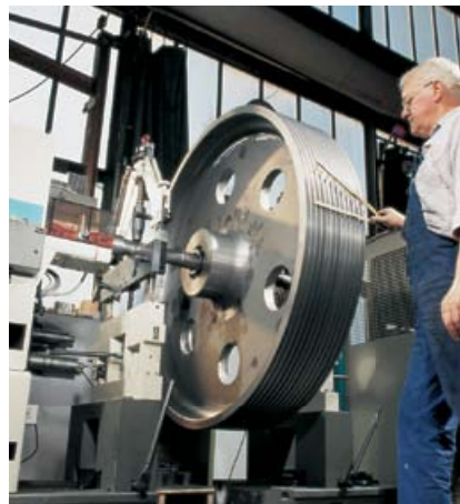
Universal-joint drive (U)

Selection of a drive system is determined by the shape or your rotors. Combinations of different drive systems on one machine are possible. Underslung belt drives (BU) provide