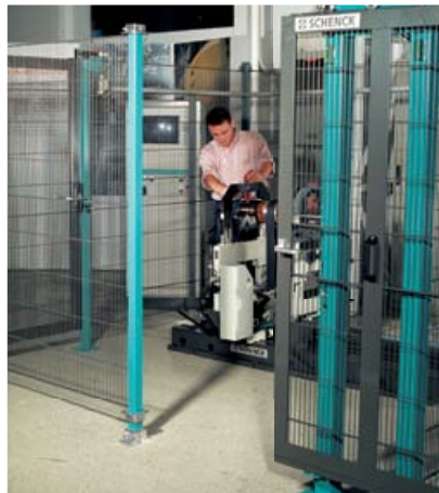
Class B protection

Series HM balancing machines usually require Class B or Class C enclosures. Safety class B should be chosen, if contact with the rotor or parts of the drive system may result in injury. Class C is to be used in cases, where the hazard of fragments detaching from the rotor cannot be ruled out entirely. The size, shape, hardness and tangential speed of a projected fragment are used to calculate the penetration potential. The safety enclosure