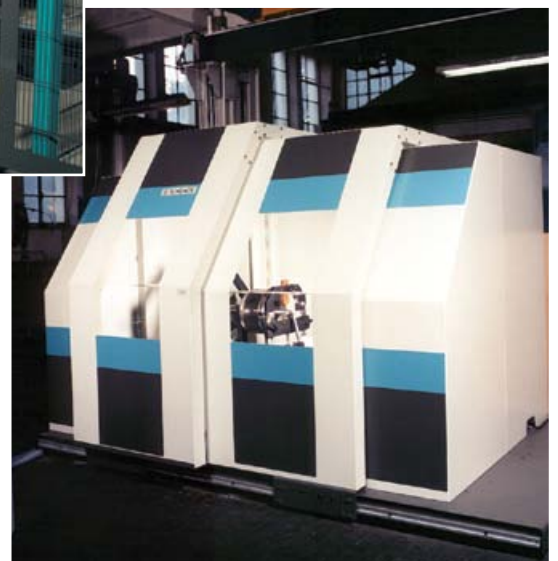
Class C protection

must be capable of containing any such projected rotor fragments.