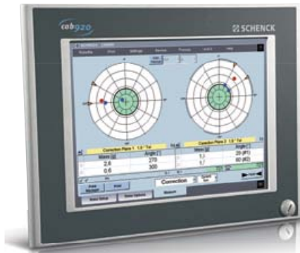
Measuring unit CAB 920