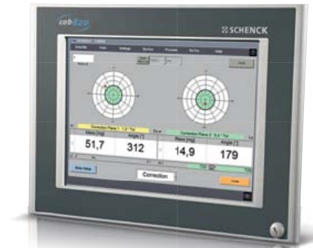
Measuring unit CAB 820

The choice of protective enclosure is determined by the danger the rotor presents, with due consideration to balancing speed, method of unbalance correction and maximum penetration energy of rotor components or fragments.