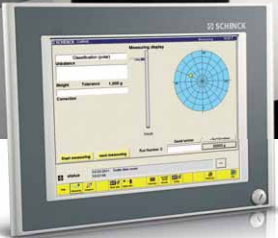
CAB 945 simplest operation and clear representation of the balancing results